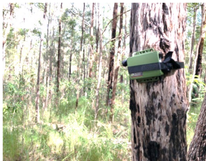
Figure 12: Song Meter Mini set in the field. A python lock or strap may be fitted through the top loops in the unit.